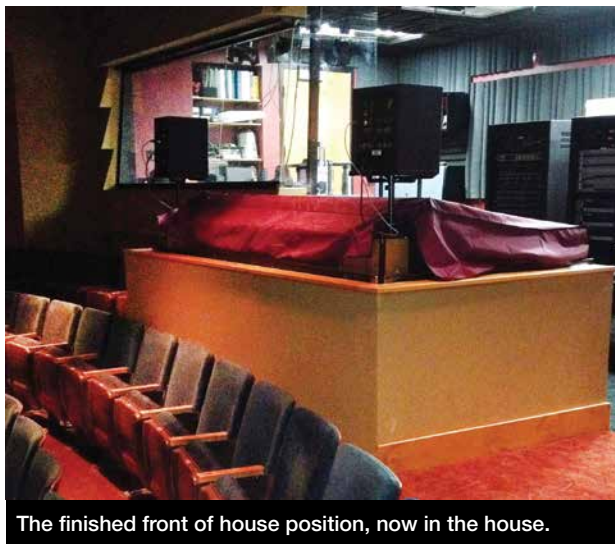
The finished front of house position, now in the house.

These “homemade” looms are color-coded in both Tech-flex sleeving and connector shell color to facilitate the fastest possible patch at the rear of the console. The looms then terminate in stage boxes that are stacked and bolted in the back of two 40-space