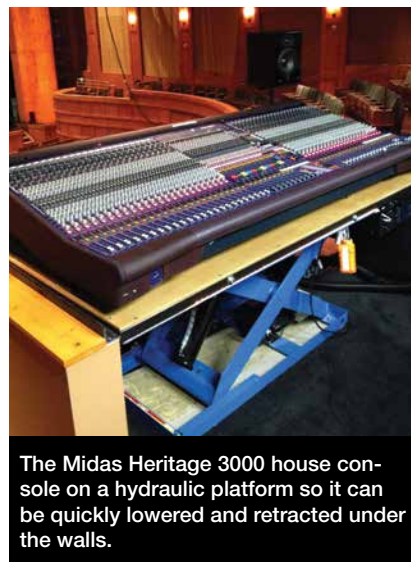
The Midas Heritage 3000 house console on a hydraulic platform so it can be quickly lowered and retracted under the walls.

A year went by as multiple discussions were ongoing regarding the last piece of the puzzle, focusing on a dramatic upgrade to the collective experiences of house and guest engineers. The dilemma: