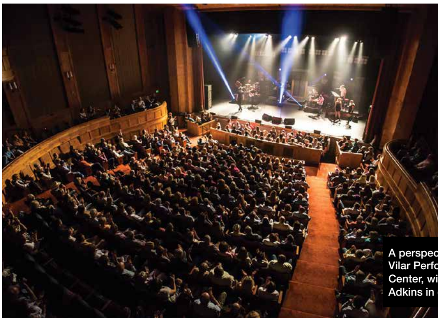
A perspective of the Vilar Performing Arts Center, with Trace Adkins in concert.